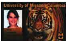
2 Missouri Institution of Higher Education