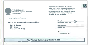
3 Bank Statement