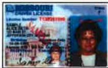
1 Missouri Driver's License