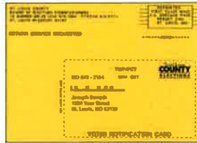
1 & 3 Local Election Authority