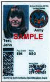
1 Federal Government