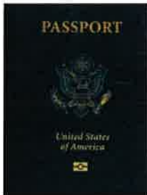
1 Federal Government