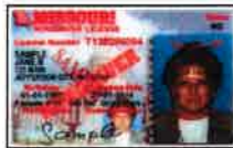
1 Missouri Non Driver's License