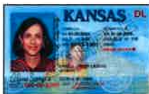
4 Out of State Driver's License